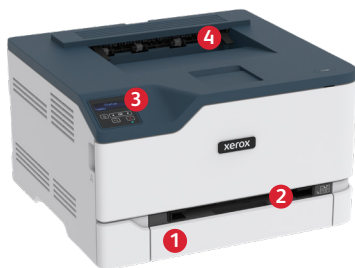
Xerox® C230 Color Printer