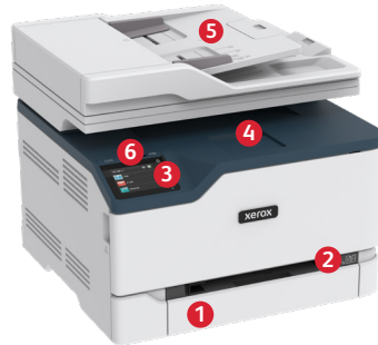
Xerox® C235 Color Multifunction Printer